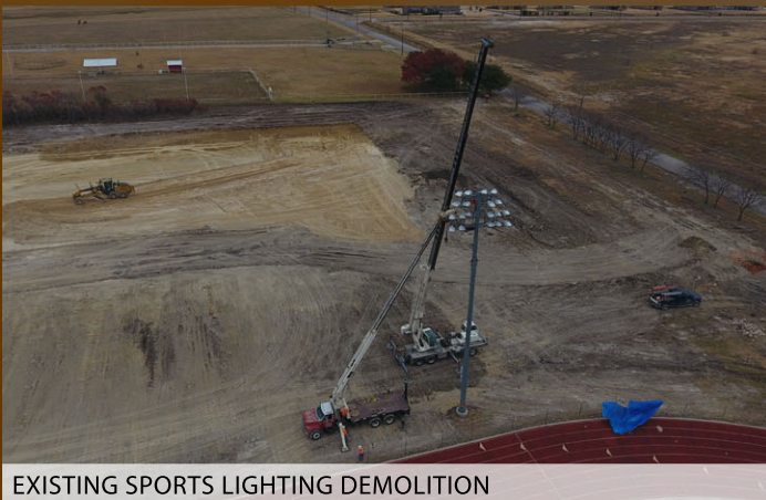
EXISTING SPORTS LIGHTING DEMOLITION