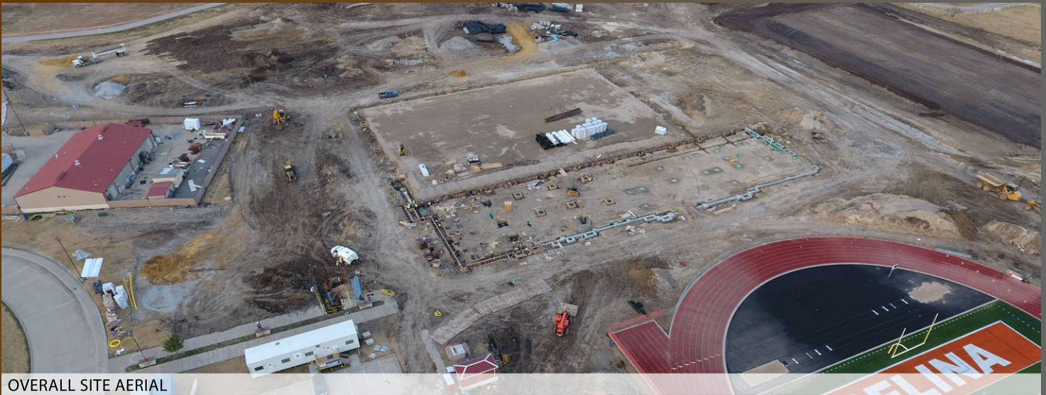
OVERALL SITE AERIAL