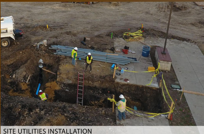
SITE UTILITIES INSTALLATION