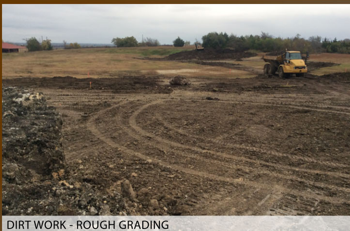
DIRT WORK - ROUGH GRADING