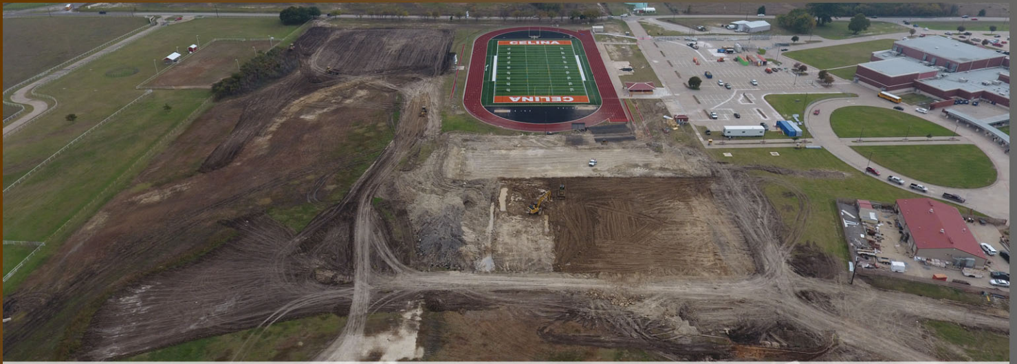
OVERALL SITE AERIAL